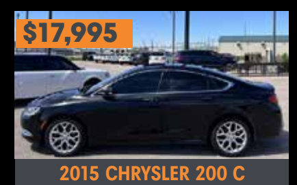
ONLY 63,912 MILES, PANORAMIC ROOF, HEATED LEATHER, NAVIGATION, POWER SEATS, BACKUP CAMERA, LOADED, LOW LOW MILES!

ALUMINUM WHEELS, KEYLESS ENTRY, FOG LAMPS, BLIND SPOT, SYNC, SUNROOF, HEATED SEATS, SPOILER, LOADED!