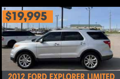
ONLY 77,698 MILES, LIMITED 4X4, DUAL MOONROOF, HEATED AND COOLED LEATHER, NAVIGATION, LOADED, LOW LOW MILES.