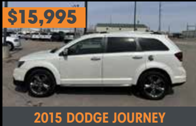
CROSSROAD, AWD, 3.6L V6 AUTO, SUNROOF, HEATED LEATHER, NAVIGATION, HEATED STEERING WHEEL, LOADED, LOW MILES!