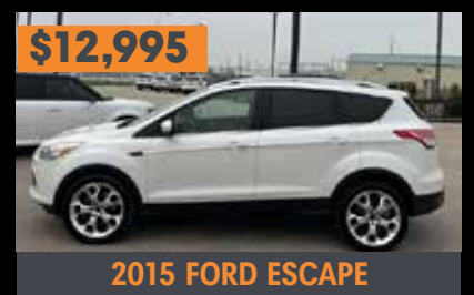
ALUMINUM WHEELS, BLIND SPOT, FOG LAMPS, BACKUP CAMERA, SUNROOF, NAVIGATION, SYNC, DUAL POWER SEATS, LOADED!

LOCAL, ALUMINUM WHEELS, BLUETOOTH, A/C, TILT, CRUISE, POWER WINDOWS/LOCKS, WELL MAINTAINED, LOADED!