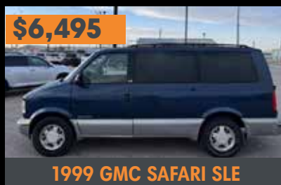
LOCAL! 4.3L V6 AUTO, ALUMINUM WHEELS, PWR WIND/LOCKS, AIR, TILT, CRUISE!

HEATED LEATHER, DVD, REAR AC/HEAT, DUAL POWER SEATS, QUAD BUCKETS, 3RD ROW, ALUMINUM WHEELS, TRAILER TOW, LOADED!