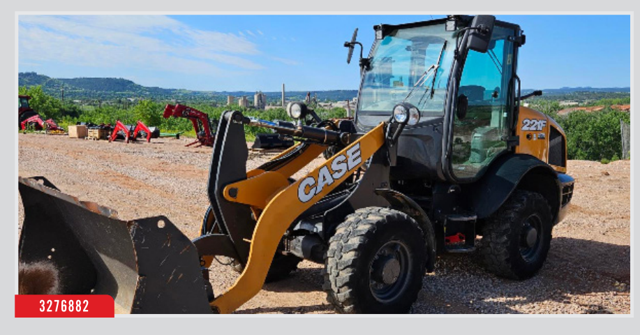
2018 Case 221F Compact , 4225 Hrs, SSL Cplr, 1.57yd Bkt, Cab/Air, 365/70 R18 L2 Tires (60%), RC, 3rd Spl, $69,930