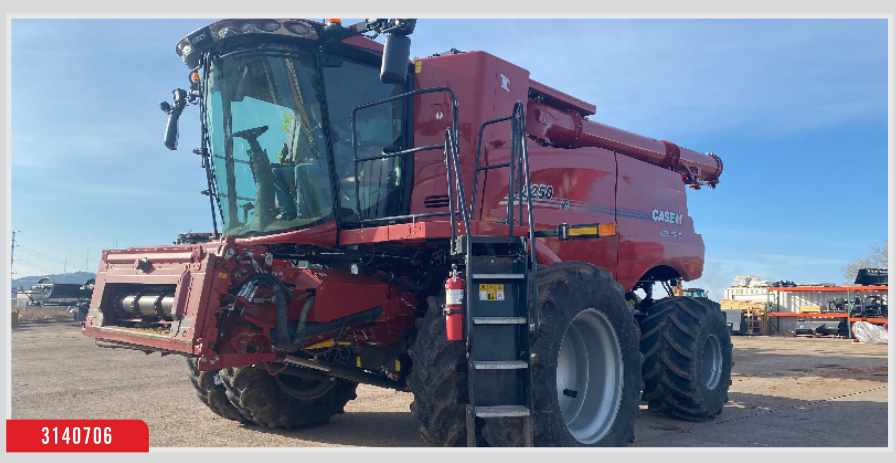
2020 Case IH 8250, 1060/740 Hrs, 620/70R42 Front Duals, 750/65R26 Rears, Guidance Ready w/Receiver, Monitor, Automation, Rock Trap, $410,220

TITAN MACHINERY Power & Precision to Grow®