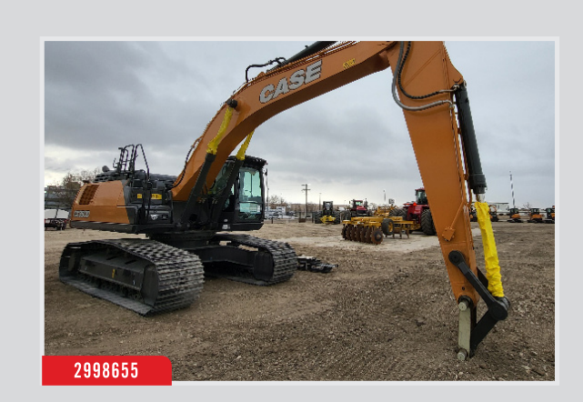
2023 Case CX350D , 10 Hrs, 85,000lb Class, Cab/Air, Aux Hyd, Hyd Thumb, Hyd Cplr, 100% Track, Call