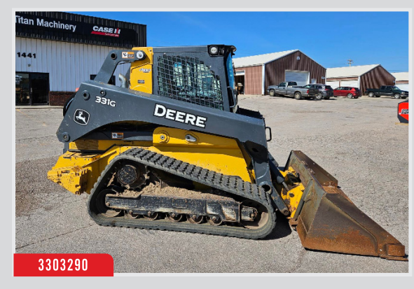
2019 John Deere 331G, 4160 Hrs, Cab/Air, Hyd Cplr, 2-Spd, 3100lb Rated Lift, EH Hand Ctrls, RC, $45,765