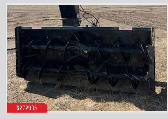
\textbf{2021 Red Devil 23608,} \ \mathsf{PTO Drive,} \ \textbf{\$11,000}