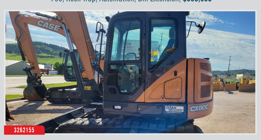
2020 Case CX80C, 415 Hrs, Cab/Air, Aux Hyd, Hyd Cplr, $116,640