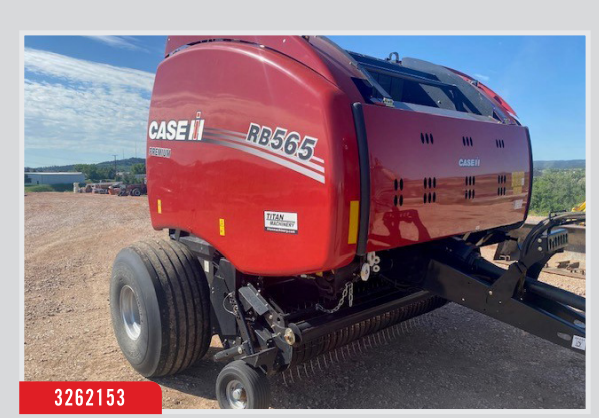
2020 Case RB565 , 4300 Bales, Round, Belt, $52,640