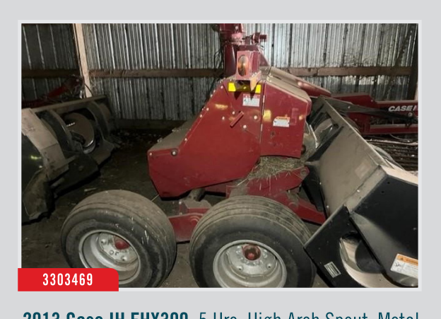
2013 Case IH FHX300 , 5 Hrs, High Arch Spout, Metal Detector, Includes 3-Row Corn Head, $29,900