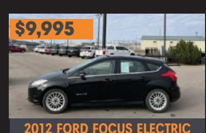
NAVIGATION, BACK-UP CAMERA, BLIND SPOT.

WHEELS, KEYLESS ENTRY, BLUETOOTH, LOADED! 136.453 MILES