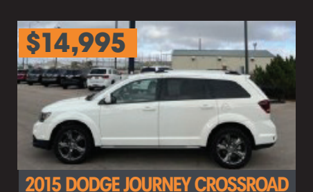
CROSSROAD AWD, 3.5L V6 AUTO, SUNROOF,

ONE-OWNER, AWD, 3.0L V6 AUTO, SUNROOF, HEATED LEATHER, BACK-UP CAMERA, BLUETOOTH, LOADED, LOW MILES