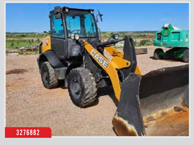
2018 Case 221F Compact , 4225 Hrs, SSL Cplr, 1.57yd Bkt, Cab/Air, 365/70 R18 L2 Tires (60%), RC, 3rd Spl, $69,930