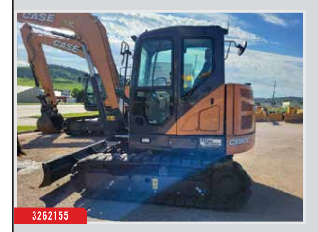
2020 Case CX80C, 415 Hrs, 18,000lb Op Weight, Cab/Air, Aux Hyd, Hyd Cplr, Blade, $108,443