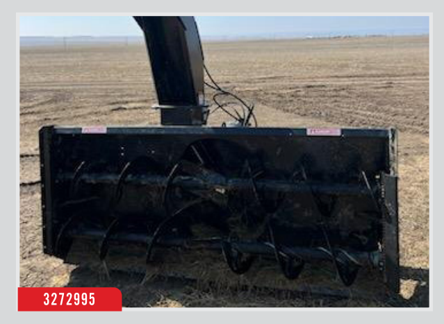
2021 Red Devil 23608, PTO Drive, $7,875