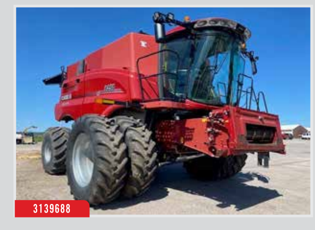
2020 Case IH 8250, 1175/865 Hrs, Guidance Ready w/Receiver & Controller, Pro 700, Rock Trap, Automation, Bin Extension, $386,900