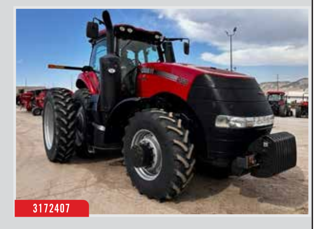
2020 Case 250, 3965 Hrs, 19-Spd Pwr Shift, 480/80R46 Rear Duals, 420/90R30 Fronts, Guidance Ready, 4 Remotes, 1000 PTO, Std Pump, $170,467