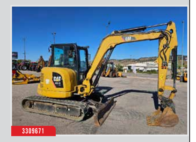
2012 Caterpillar 305.5E, 6235 Hrs, 10,000lb Op Weight, Cab/Air, Aux Hyd, Mech Coupler, Blade, $39,900