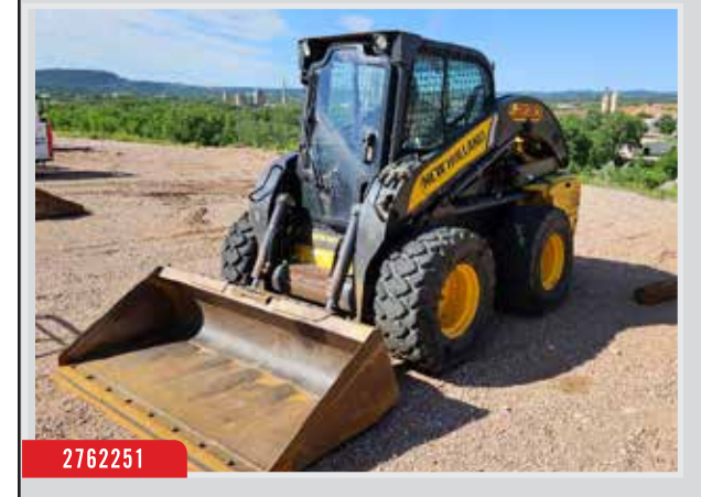
2014 New Holland L230, 3390 Hrs, 3000lb Rated Lift, Cab, Cplr, $37,050