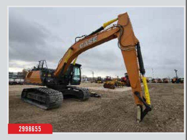
2023 Case CX350D, 10 Hrs, 85,000lb Class, Cab/Air, Aux Hyd, Hyd Thumb, Hyd Cplr, 100% Track, Call