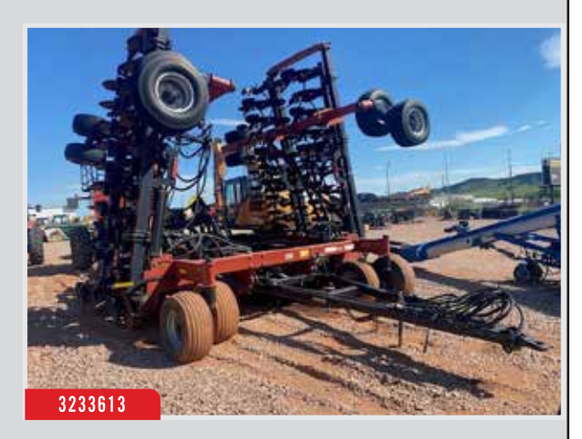
2006 Case IH SDX40, 40', 7.5" Spacing, 280bu Tow-Behind Tank, $66,490