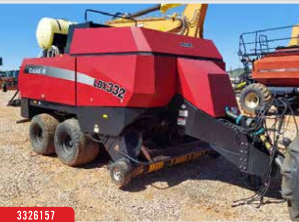
2007 Case IH LBX332, 2 1/2'x3' Square, 1000 PTO w/Slipclutch, Std Pickup, Electric Bale Monitor/ Counter, $39,900