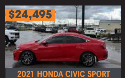
REMOTE START, ALUMINUM WHEELS, BACK UP CAMERA, BLUETOOTH, LOADED, REMAINING FACTORY WARRANTY 22,102 MILES!

ONLY 64,873 MILES, 300C AWD, 3.6 V6 AUTO, DUAL PANE PANORAMIC SUNROOF, NAVIGATION, LOADED!