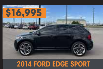
SPORT, 3.7L V6 AUTO, AWD, DUAL MOONROOF, HEATED LEATHER, POWER LIFTGATE, BLUETOOTH, LOADED, LOW MILES!

ONLY 83,330 MILES, SL AWD, SUNROOF, NAVIGATION, HEATED LEATHER SEATS, POWER DRIVERS SEAT, LOADED, LOW MILES!