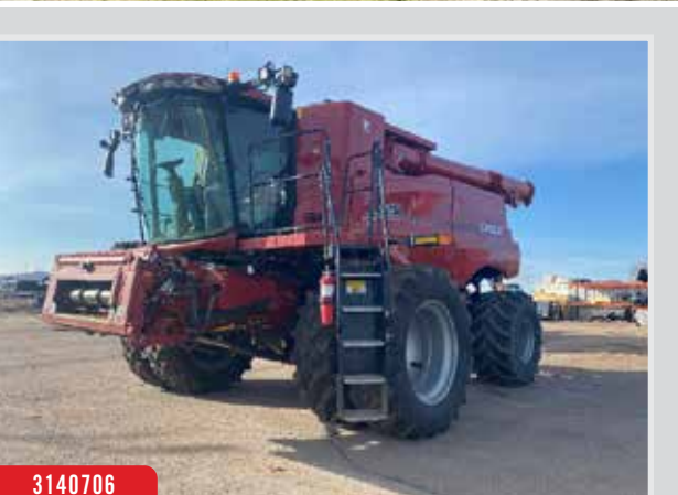
2020 Case IH 8250 , 1060/740 Hrs, 620/70R42 Front Duals, 750/65R26 Rears, Guidance Ready w/ Receiver, Monitor, Automation, Rock Trap, $410,220