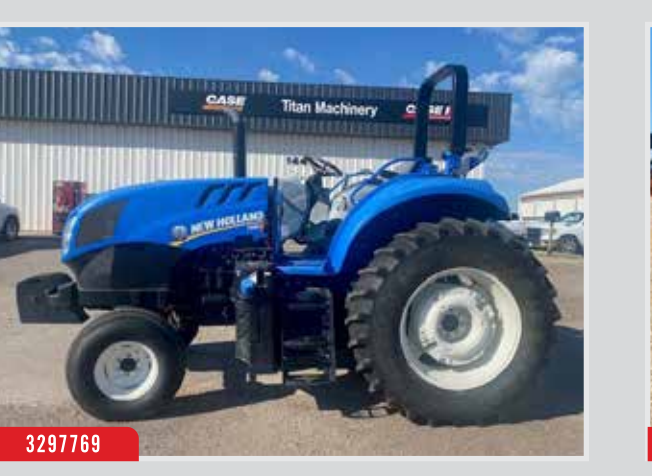
2016 New Holland TS6110, 100 Hrs, 540 PTO, Excellent Tires, $41,810