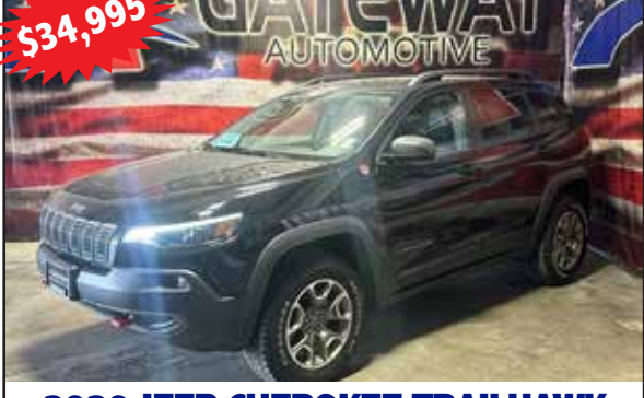
2020 JEEP CHEROKEE TRAILHAWK 4WD, 4 CYL 2L GASOLINE, 34K MILES

2021 TOYOTA RAV4 ADVENTURE AWD, 4 CYL 2.5L GASOLINE, 62K MILES